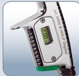
Available option: DIGITAL® version – integrated pressure measurement and adjustment – indispensable for perfect colour match.