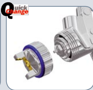
SATA® QC™ Quick Change™ – quick air cap change with just one and a half turns.