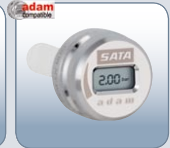
SATA® adam™ available as retrofit accessory – digital air micrometer to upgrade standard spray guns.