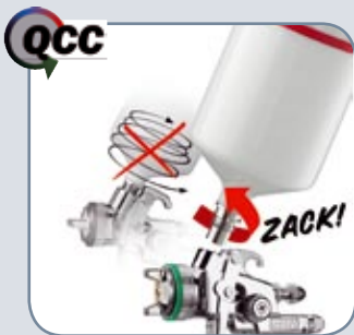
QCC™ cup connection – quick cup exchange, easy cleaning – only the original is equipped with the red ring.